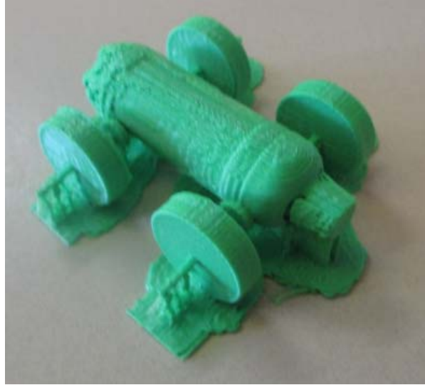
Figure 2. Example of a 3D Printed Model Car