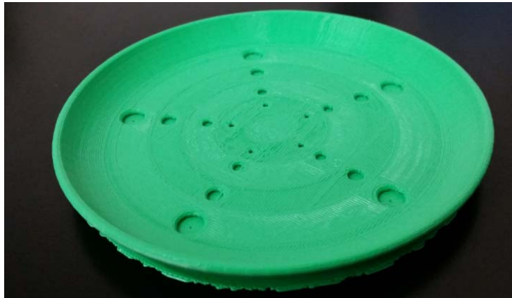
Figure 3. Example of 3D Printed Flying Disc

The honors students responded to surveys after each of the 3D printing experiences and the results are shown in Table 3. By comparing the means using a Wilcoxon Rank Sum test for statistical significance, the difference in responses between male and female students was not statistically significant for any of the questions including how interesting, relevant, and valuable the students perceived the experience. The relatively high mean values for interest and relevance and the lack of difference between male and female students would indicate that this is an appropriate project that is interesting to most students and not just a particular group.